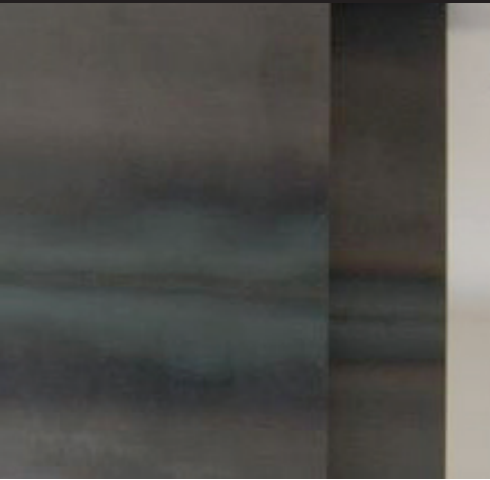
Hot Rolled Steel