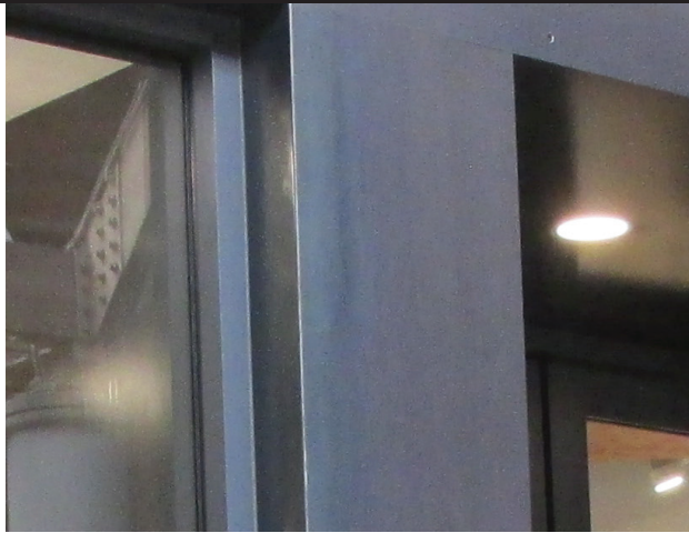
Approved API Spec for MT1011 is 0184 PC