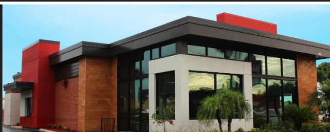
EXTERIOR STOREFRONT SYSTEMS